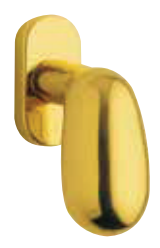
97 DK 015 LV