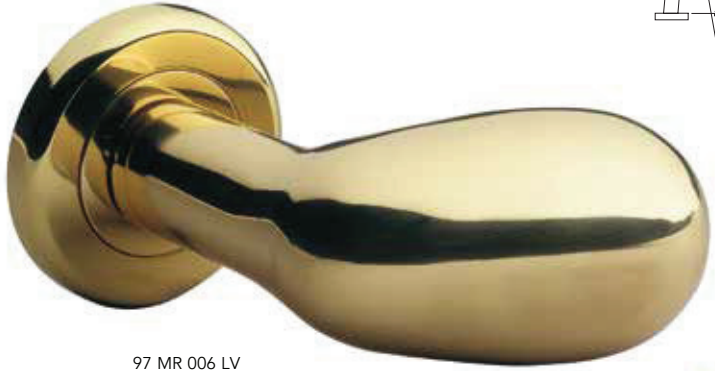
97 MR 006 LV