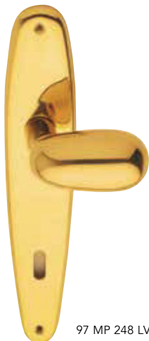
97 MP 248 LV