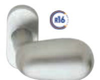
97 MR 916 OSC