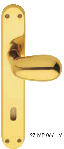
97 MP 066 LV