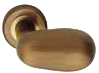
97 MR 006 BG