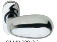
97 MR 009 OC