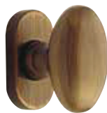
97 TK 015 BG

Per caratteristiche tecniche rosette vedi apposito capitolo soluzioni tecniche e componenti / For technical specifications rosettes see specific section technical solutions and components