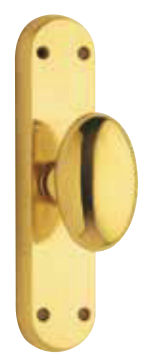
97 MA 137 LV 97 CR 137 LV