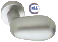
97 MR 416 OSC