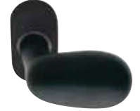
97 MR 009 NR