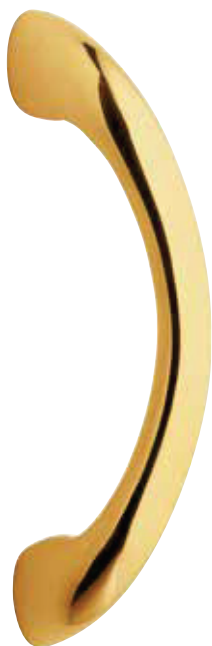
325 MS - PVD