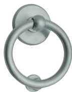
15 Satinato cromato Satin chrome