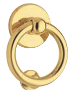
02 Lucido verniciato Polished varnished