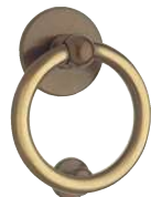
08 Bronzato graffiato Brushed bronzed