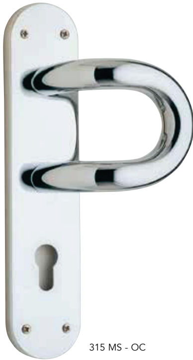
315 MS - OC