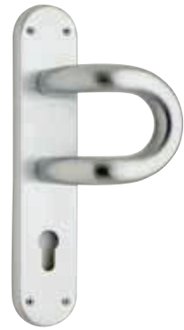
315 MS - OSC