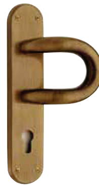
315 MS - BG