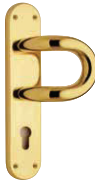
315 MS - LV